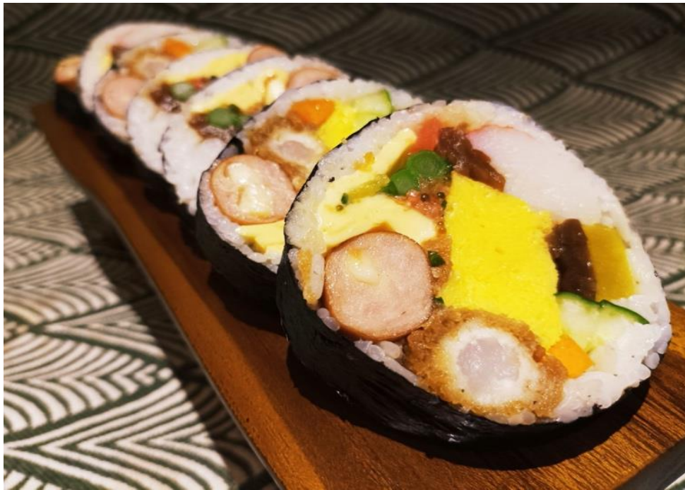
TANOSHII SPECIAL FUTOMAKI (Big Maki)