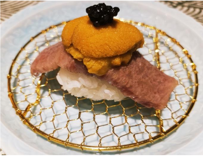
A4 UNI WAGYU SUSHI 4PCS 88

Wagyu Sushi made with only the finest cuts of A4 Wagyu Sirloin, topped with the finest Hokkaido Bafun uni.