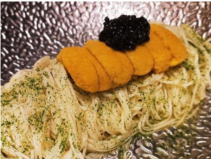
COLD TRUFFLE IKURA & UNI NOODLES 38

Wagyu Sushi made with only the finest cuts of A4 Wagyu Sirloin.