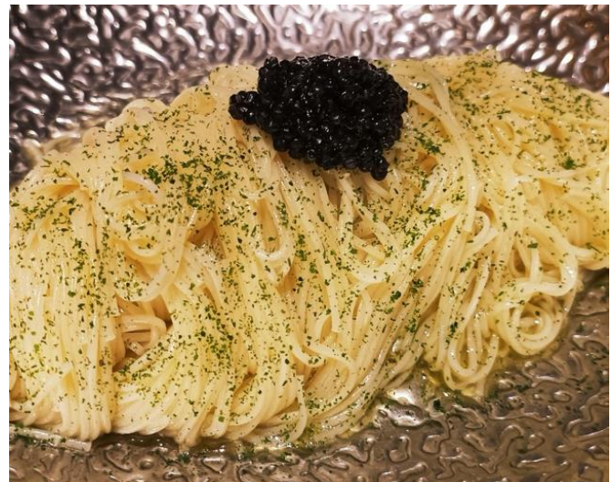
COLD TRUFFLE OIL NOODLES 18

Cold noodles with truffle oil and topped with ikura and uni.