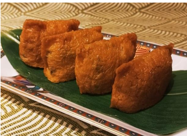
YUBU SUSHI (Inari Sushi)

★ Challenge yourself to eat it in one bite!